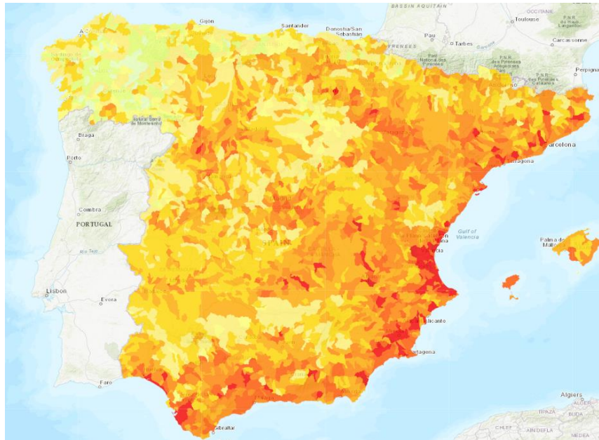
WWF Water Risk Filter map of overall water risks in Spain based on local high resolutions data set

In addition, the WWF Water Risk Filters contains over 120+ country profiles, with risk scores aggregated at country level as well detailed information on national water governance, policies and water resources. This country level risk information has helped EDEKA to assess water risks for their organic private-label products and thus determine, amongst other criteria, which can be awarded with the WWF Panda logo to help customers identify sustainable and environmentally friendly products.